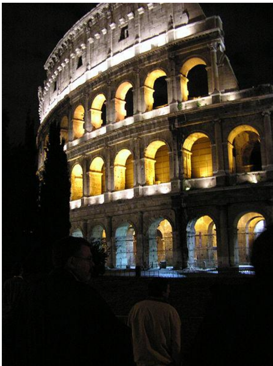
Colosseum in Rome