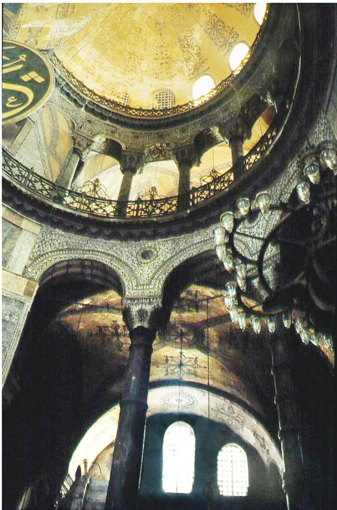
Hagia Sophia, the Church of Holy Wisdom, Istanbul